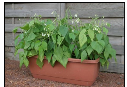
Mascotte Bush Bean