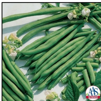
Kentucky Blue Pole Bean (left)